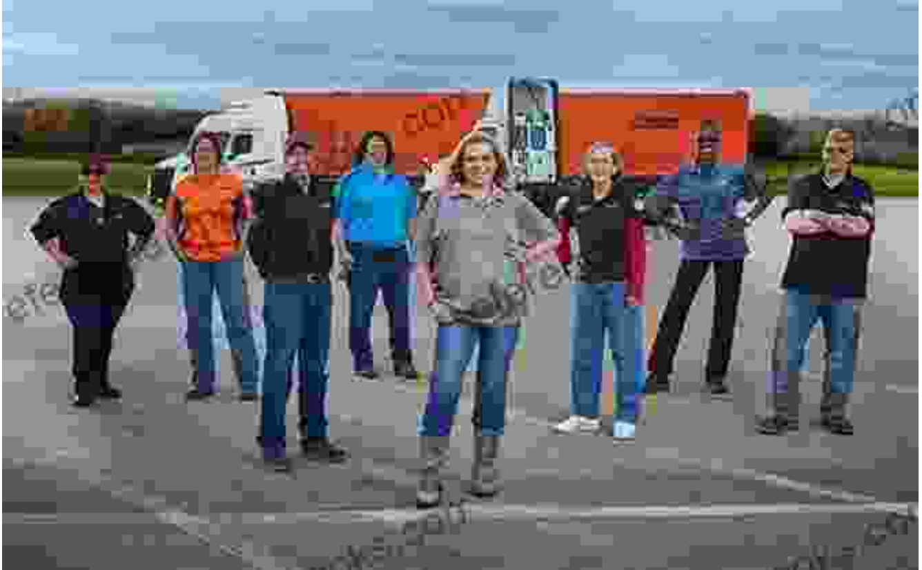
A group of truck drivers pose for a group photo.