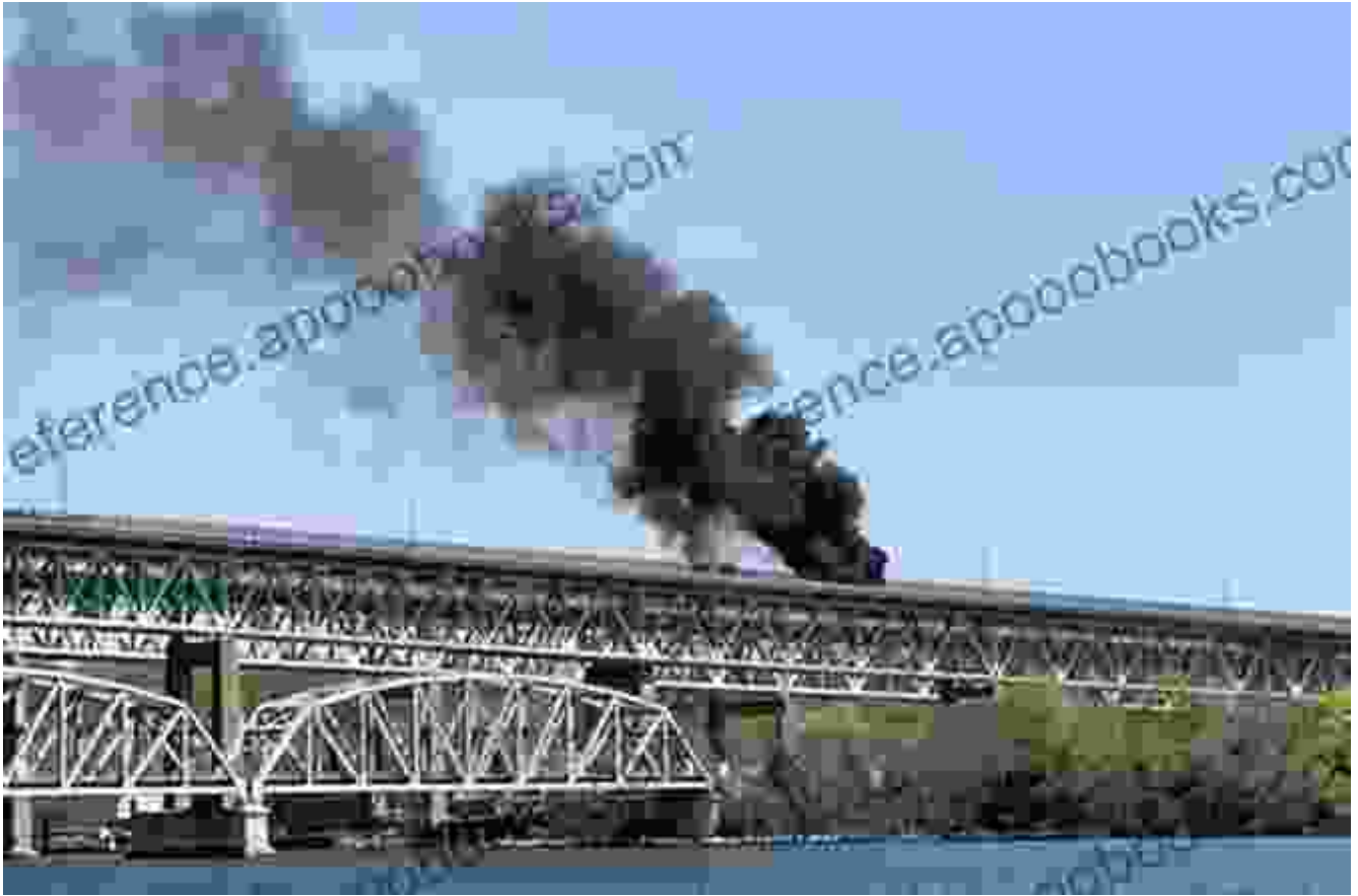
A truck drives down a highway.