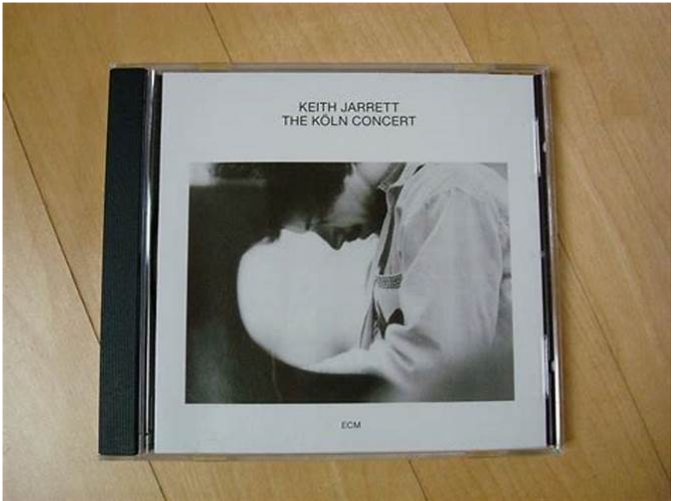
The Köln Concert album cover